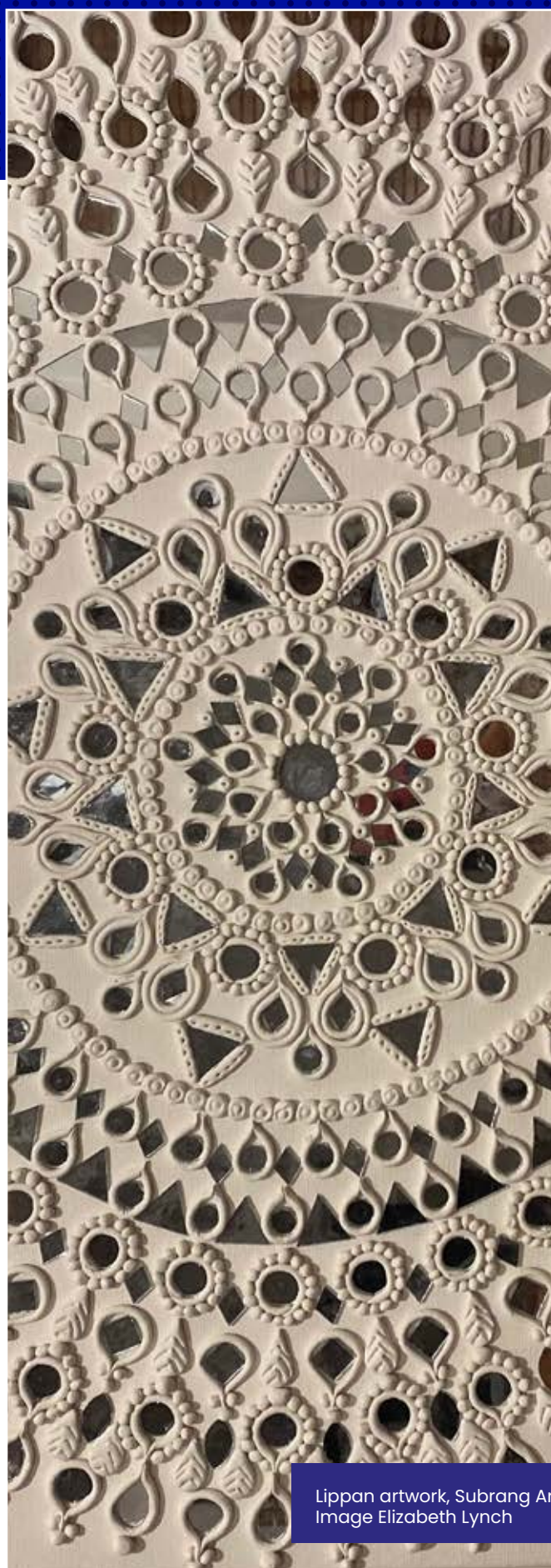
Lippan artwork, Subrang Arts, Image Elizabeth Lynch

The Sangini/Srijoni project exemplifies how well digital meeting platforms can be used and a good illustration of how creative ageing practice is supported and developed in an intergenerational setting.